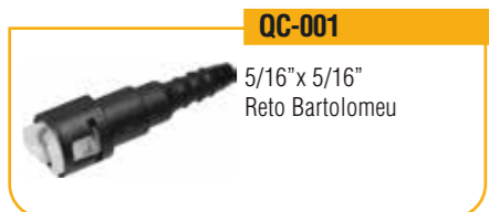
QC-001 5/16" x 5/16" Reto Bartolomeu