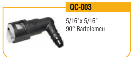
QC-003 5/16" x 5/16" 90° Bartolomeu