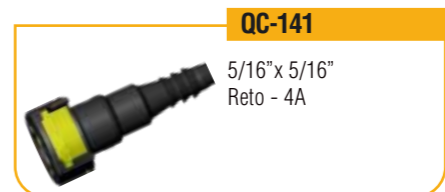
QC-141 5/16" x 5/16" Reto - 4A