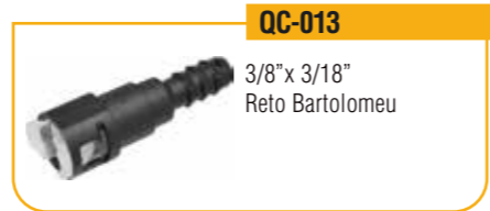
QC-013 3/8" x 3/18" Reto Bartolomeu