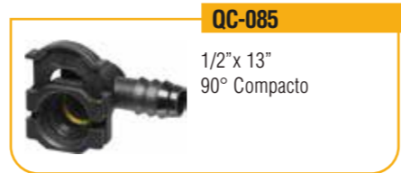
QC-085 1/2" x 13" 90° Compacto