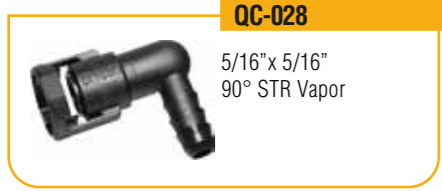
QC-028 5/16" x 5/16" 90° STR Vapor