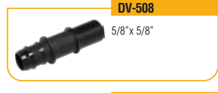
DV-508 5/8" x 5/8"