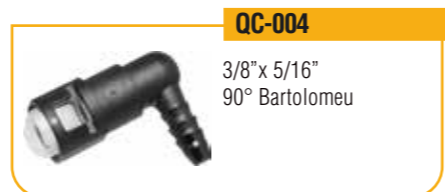
QC-004 3/8" x 5/16" 90° Bartolomeu