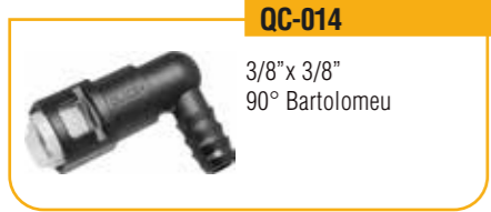
QC-014 3/8" x 3/8" 90° Bartolomeu