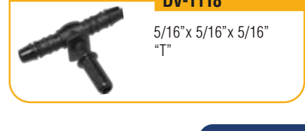
DV-1118 5/16" x 5/16" x 5/16" "T"