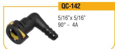
QC-142 5/16" x 5/16" 90° - 4A