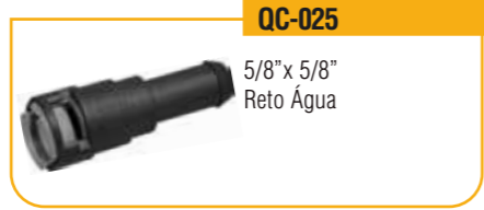
QC-025 5/8" x 5/8" Reto Água