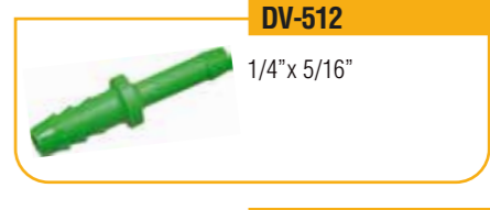
DV-512 1/4" x 5/16"