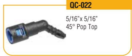
QC-022 5/16" x 5/16" 45° Pop Top