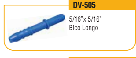
DV-505 5/16" x 5/16" Bico Longo