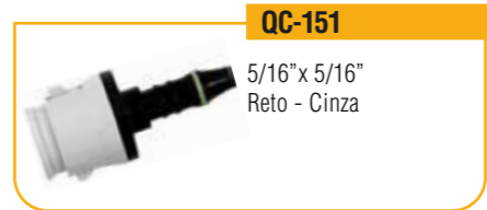
QC-151 5/16" x 5/16" Reto - Cinza