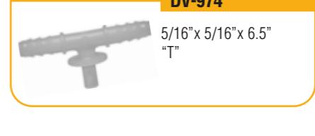
DV-974 5/16" x 5/16" x 6.5" "T"