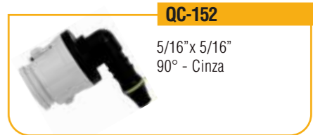
QC-152 5/16" x 5/16" 90° - Cinza