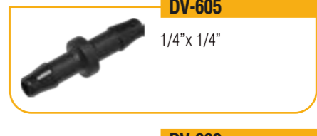
DV-605 1/4" x 1/4"