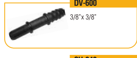
DV-600 3/8" x 3/8"