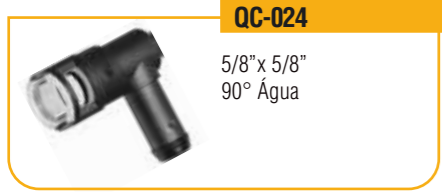
QC-024 5/8" x 5/8" 90° Água