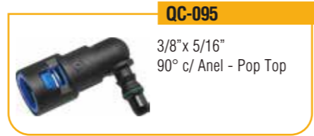
QC-095 3/8" x 5/16" 90° c/ Anel - Pop Top