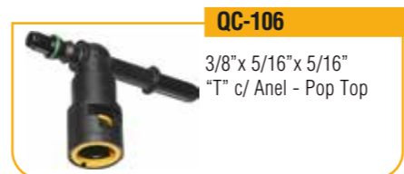
QC-106 3/8" x 5/16" x 5/16" "T" c/ Anel - Pop Top