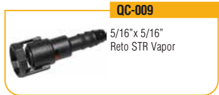
QC-009 5/16" x 5/16" Reto STR Vapor