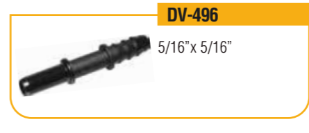
DV-496 5/16" x 5/16"