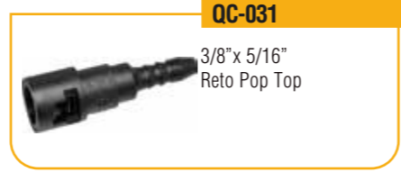
QC-031 3/8" x 5/16" Reto Pop Top