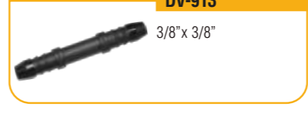
DV-913 3/8" x 3/8"