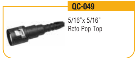
QC-049 5/16" x 5/16" Reto Pop Top