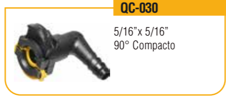
QC-030 5/16" x 5/16" 90° Compacto