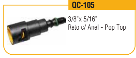
QC-105 3/8" x 5/16" Reto c/ Anel - Pop Top