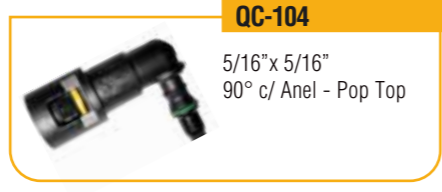
QC-104 5/16" x 5/16" 90° c/ Anel - Pop Top