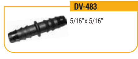
DV-483 5/16" x 5/16"