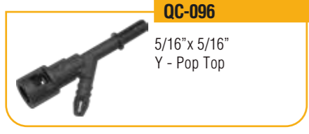
QC-096 5/16" x 5/16" Y - Pop Top