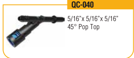
QC-040 5/16" x 5/16" x 5/16" 45° Pop Top