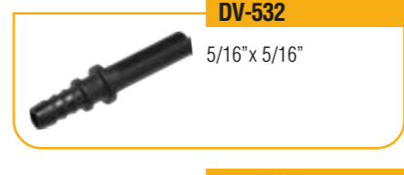
DV-532 5/16" x 5/16"