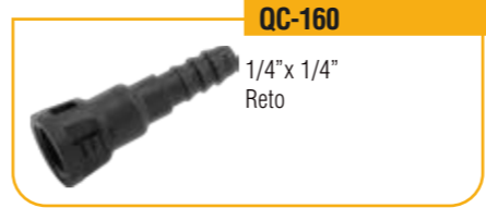
QC-160 1/4" x 1/4" Reto