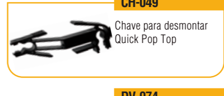
CH-049 Chave para desmontar Quick Pop Top