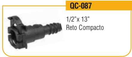
QC-087 1/2" x 13" Reto Compacto