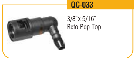
QC-033 3/8" x 5/16" Reto Pop Top