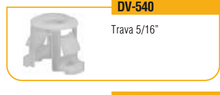
DV-540 Trava 5/16"