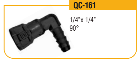
QC-161 1/4" x 1/4" 90°