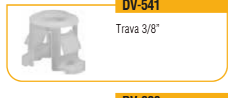
DV-541 Trava 3/8"