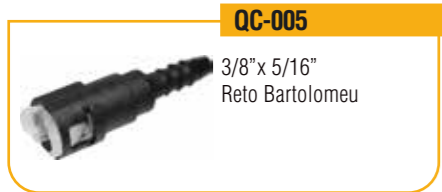
QC-005 3/8" x 5/16" Reto Bartolomeu