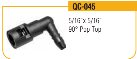
QC-045 5/16" x 5/16" 90° Pop Top