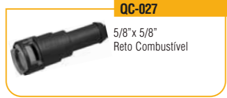
QC-027 5/8" x 5/8" Reto Combustível