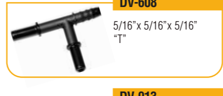
DV-608 5/16" x 5/16" x 5/16" "T"