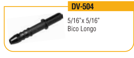
DV-504 5/16" x 5/16" Bico Longo