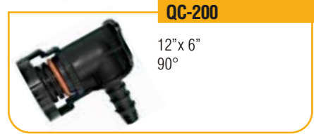
QC-200 12" x 6" 90°