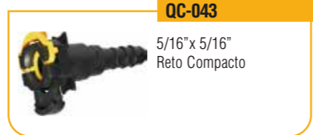
QC-043 5/16" x 5/16" Reto Compacto