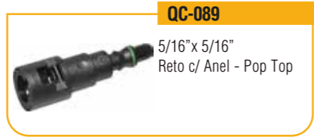
QC-089 5/16" x 5/16" Reto c/ Anel - Pop Top