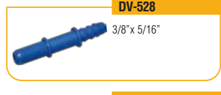
DV-528 3/8" x 5/16"