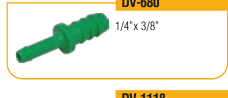
DV-680 1/4" x 3/8"