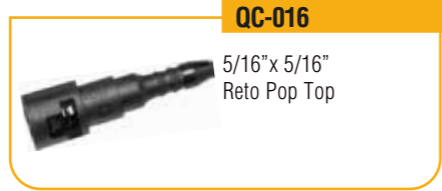
QC-016 5/16" x 5/16" Reto Pop Top